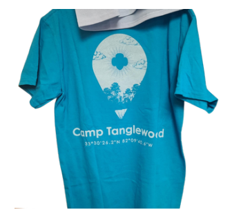
Camp Tanglewood T-Shirt - $15