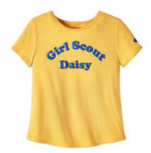
Daisy T-Shirt - $20