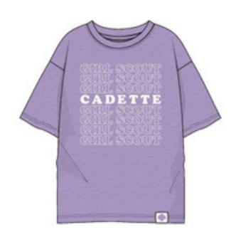
Cadette Oversized T-Shirt - $23