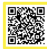
2026 Parent Debt Procedure