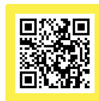
Product Program Manager Agreement