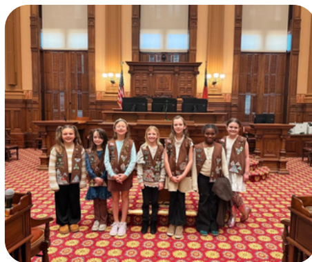
Girl Scout Day at the Capitol