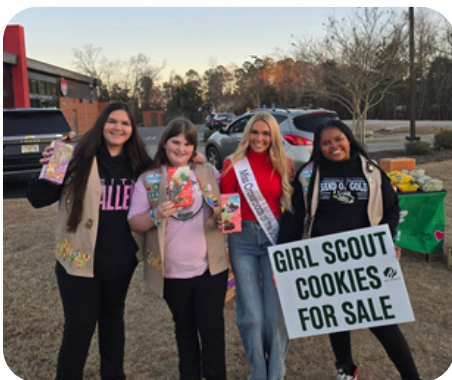
Cookie Season Fun!