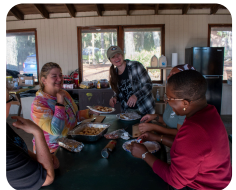
LEAP Volunteer Conference