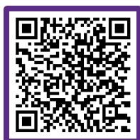
Service Unit Agenda